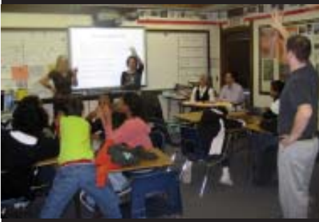
Time is up. Your answer please!