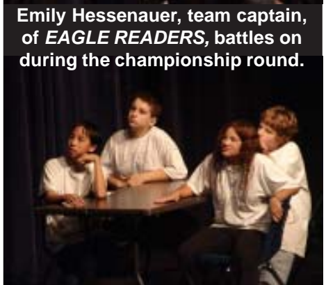
The SUSPICIOUS EAGLES watch to see if they answered correctly.