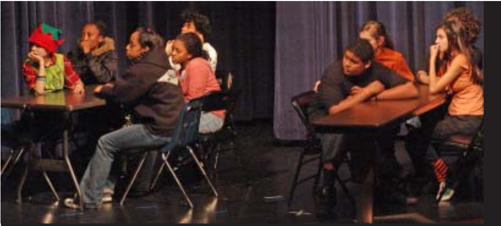
The SUPER KIDS and IT'S ALL GOOD await their next question.