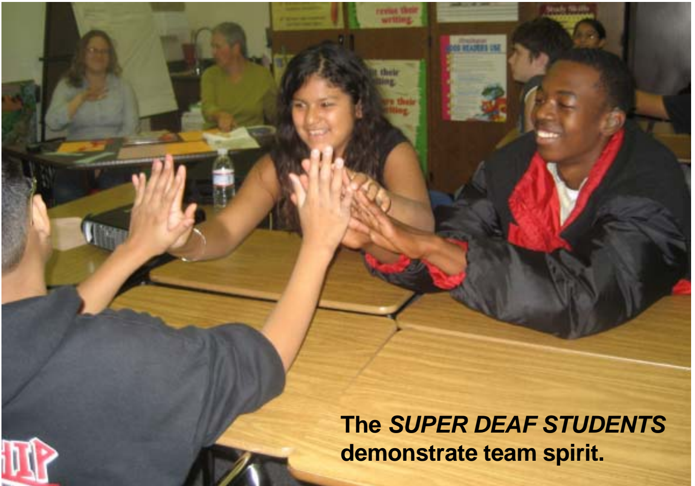
The SUPER DEAF STUDENTS demonstrate team spirit.

The California News California School for the Deaf 39350 Gallaudet Drive Fremont, CA 94538