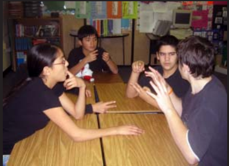
THE BLACK DRAGONS ponder the answer to their question.