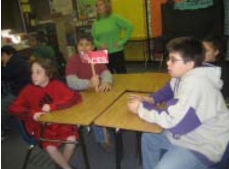
THE ACES intently watch as the question is being asked.