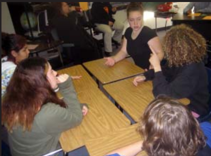
The SUPER NERDS try to reach a consensus on their answer.